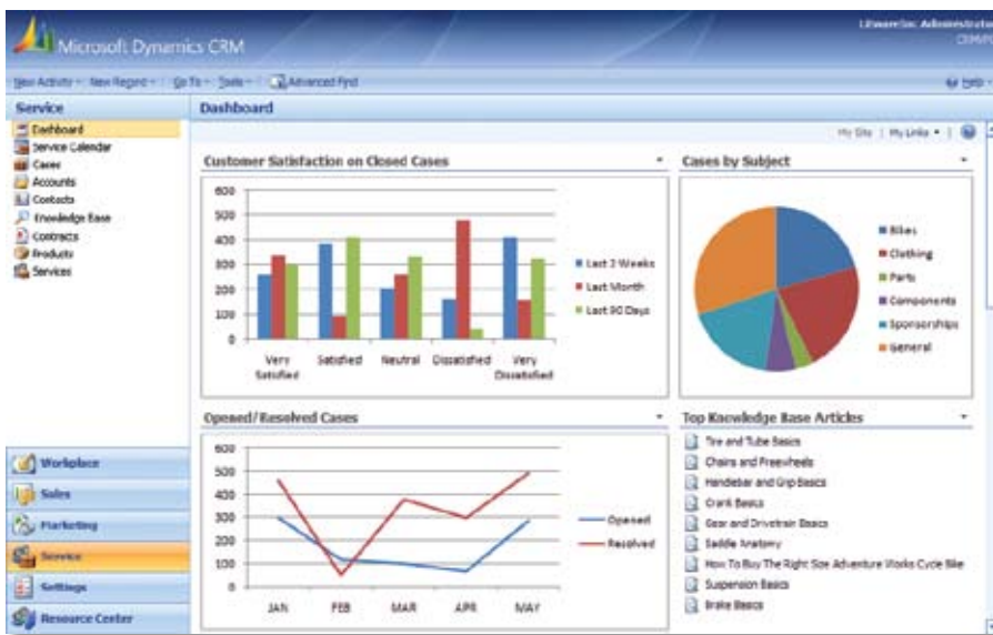
Service Analytics Dashboard (Business Intelligence).