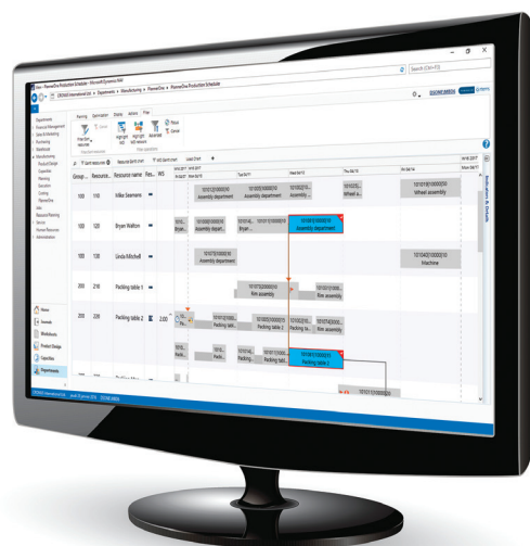
Graphical and interactive schedules that allow users to visualize the manufacturing saved data