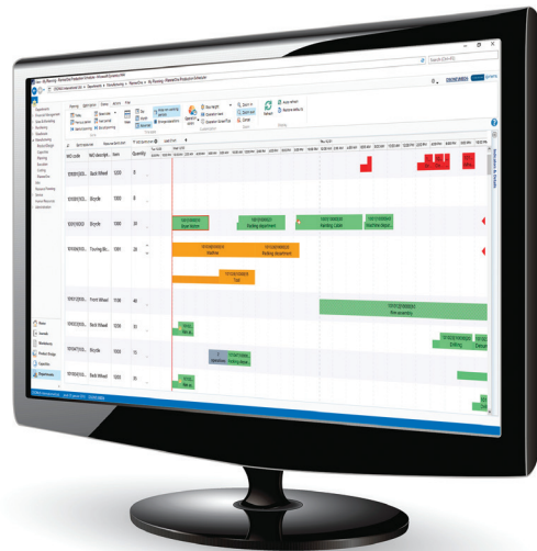
Constraint-based finite-capacity scheduling to respect objectives and constraints of manufacturers