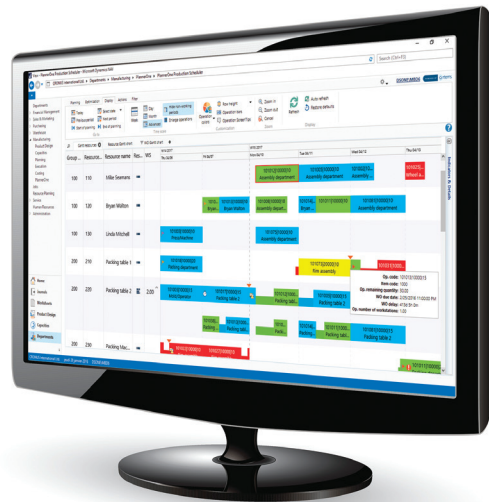
Optimization of setup times